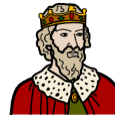
Alfred the Great