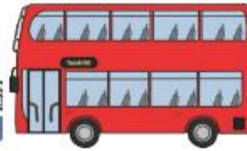
double decker bus