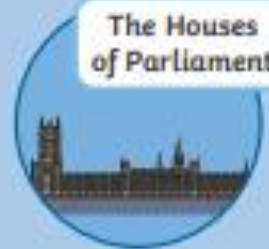
The Houses of Parliament