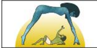
Nut and Geb